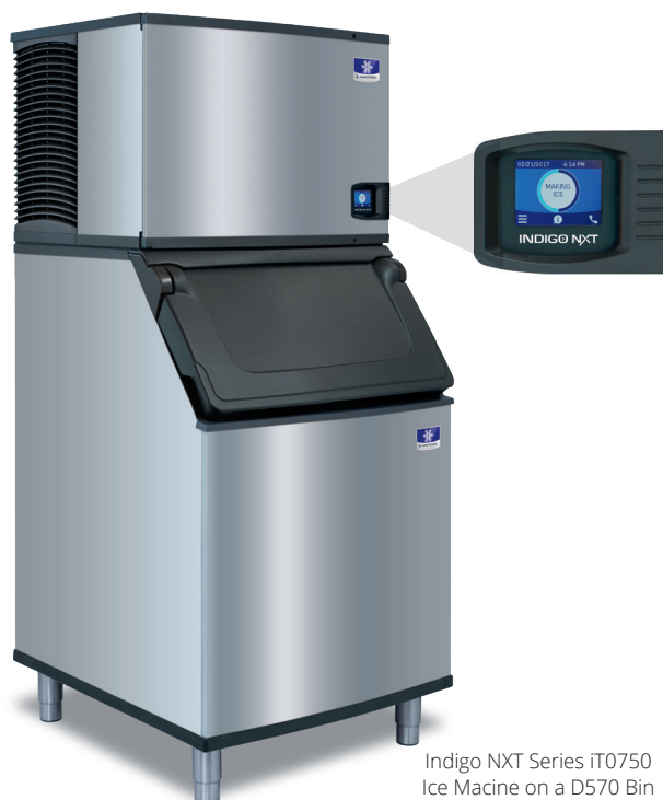
Indigo NXT Series iT0750 Ice Machine on a D570 Bin

Designed for operators who know that ice is critical to their business, the Indigo®NXT Series ice machine's preventative diagnostics continually monitor itself for reliable ice production. Improvements in cleanability and programmability make your ice machine easy to own and less expensive to operate.