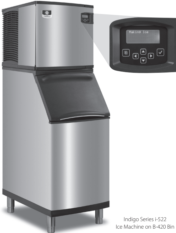
Indigo Series i-522 Ice Machine on B-420 Bin

Designed for operators who know that ice is critical to their business, the Indigo™ Series ice machine's preventative diagnostics continually monitor itself for reliable ice production. Improvements in cleanability and programmability make your ice machine easy to own and less expensive to operate.