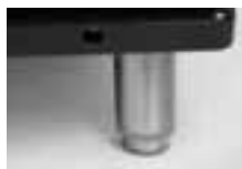
Adjustable legs (from 101-152mm) available with optional leg kit K-00345.