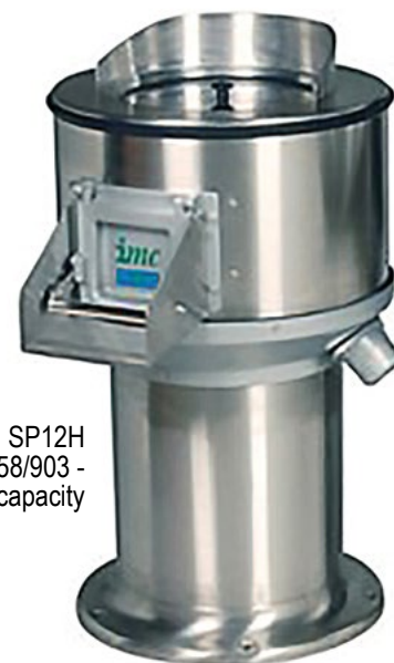
SP12H Model F58/903 - 300Kg/Hr capacity

With a choice of pedestal heights to fit a tank or catering sink, a flexible hose or plumbed-in waste outlet on either side and the option of an integrated filter basket, an SP Peeler fits easily into your working environment.