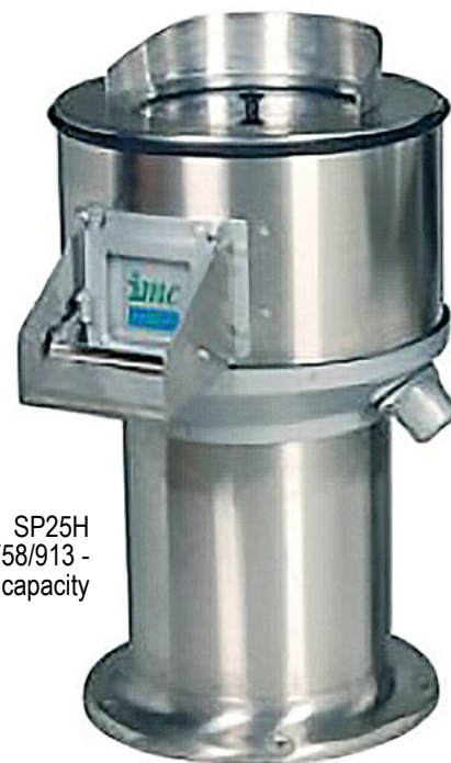
SP25H Model F58/913 - 600Kg/Hr capacity