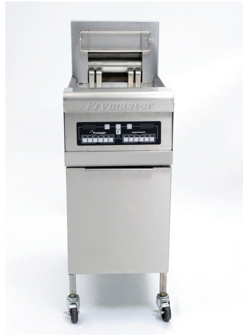
shown with optional castors and computer controller

SPECIFICATIONS ARE SUBJECT TO CHANGE WITHOUT NOTICE.