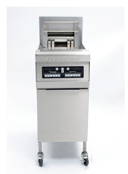
shown with optional castors and computer controller