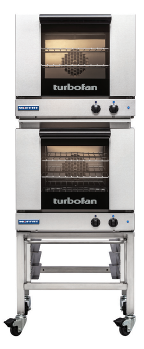
Model E23M3/2C shown

Half Size Manual / Electric Convection Ovens Double Stacked on a Stainless Steel Base Stand