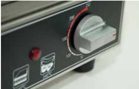
Thermostat control and indicator light

Our perennial best sellers offer large and medium sized cooking platens.