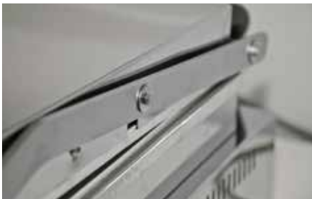
Stainless steel body and lift mechanism