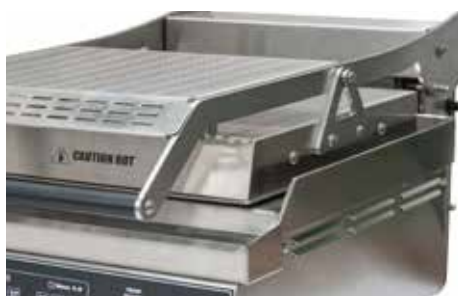
Protective heat shield