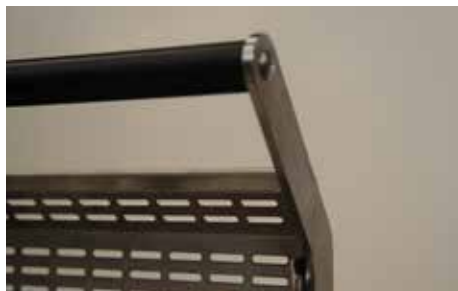
Rigid, heat protective handle