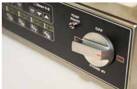
New energy saving plate selection control