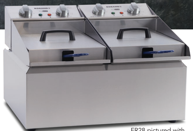
FR28 pictured with pan covers

*All these models have the same basket chip capacity of 1 Kg.