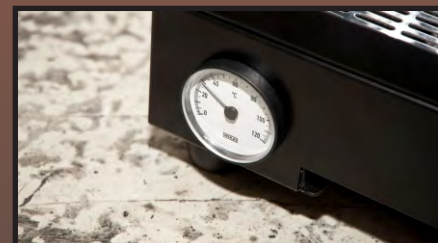
Visible temperature gauge