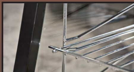
Easily removable display racks