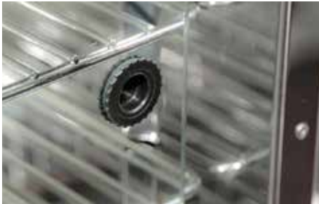
Toughened glass sliding doors

Woodson pie/food displays ensure pre-cooked food is held at a proper serving temperature whilst being displayed to enhance optimum sales.