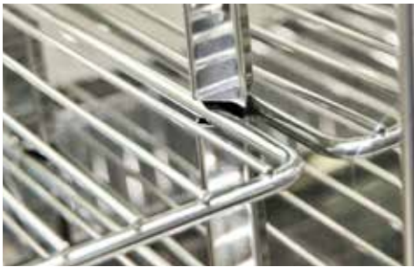
Easily removable display racks