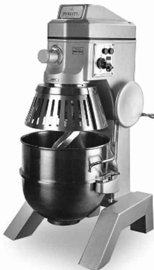
BM50AT3P with HUB attachment drive