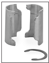
Aluminum Split Sleeve