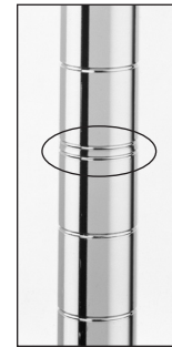
SiteSelect Posts feature double grooves every 8" (203mm) to aid assembly.