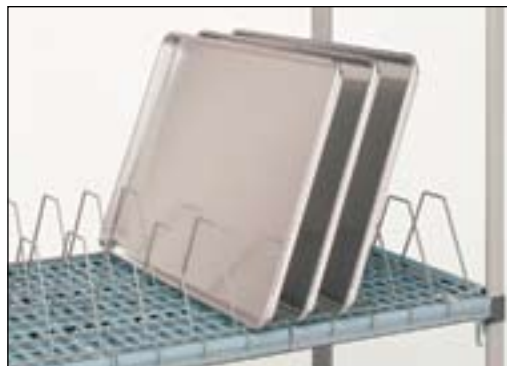
Tray Drying Rack