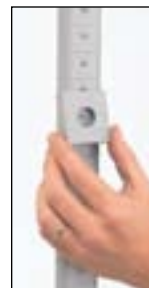
MetroMax Q Wedge Connector Included with each shelf or shelf frame. Bag of 4. Cat. No. Q9985