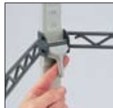
MetroMaxQ Corner Lock Release™