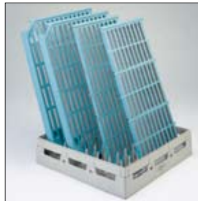
Shelf mat sections fit in the dishwasher for easy, thorough cleaning.