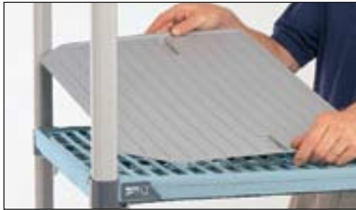
Open-grid shelf mats remove quickly for cleaning.