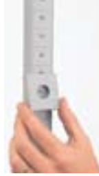
Wedge connector attaches easily to post.