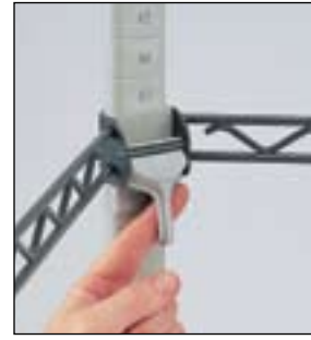
Corner Lock Release™ pulls out easily to unlock shelf for repositioning.