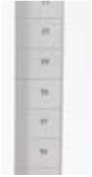
Posts are numbered at 1" (25mm) intervals.