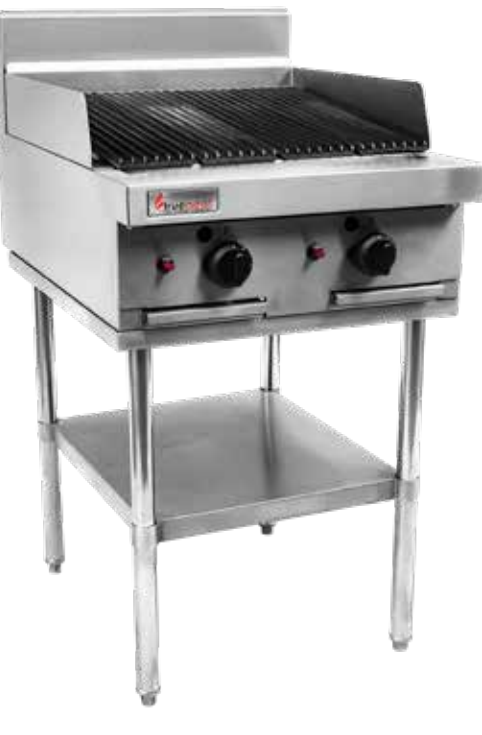
RCB4 shown with RCSTD4 stand