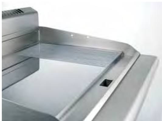
Mirror chromed griddle plate with a combined smooth and ribbed surface.