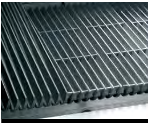
Heavy-duty reversible grates for level or inclined use.

Ask for a detailed specification sheet on any of the Waldorf Bold Chargrills outlining construction, features, options and installation information.