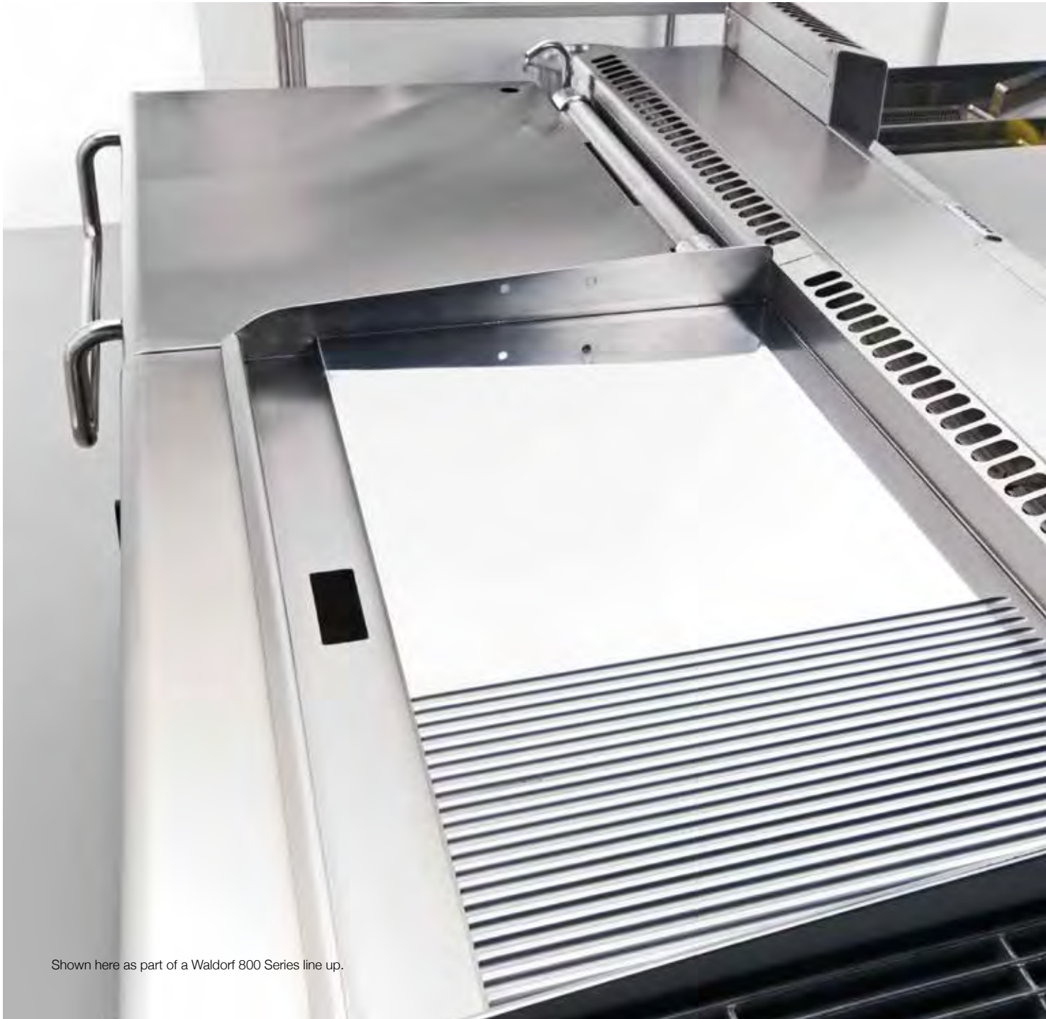
Shown here as part of a Waldorf 800 Series line up.

Griddle Oven Range includes - Drop down door with welded frame Fully welded and vitreous enamelled oven liner Cool touch stainless steel door handle Easy clean, installation and service