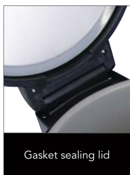
Gasket sealing lid