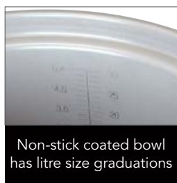
Non-stick coated bowl has litre size graduations