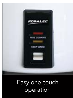
Easy one-touch operation