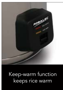
Keep-warm function keeps rice warm