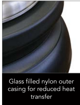
Glass filled nylon outer casing for reduced heat transfer