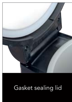
Gasket sealing lid