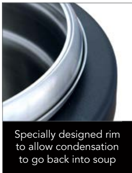
Specially designed rim to allow condensation to go back into soup