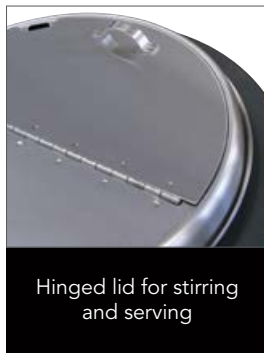
Hinged lid for stirring and serving