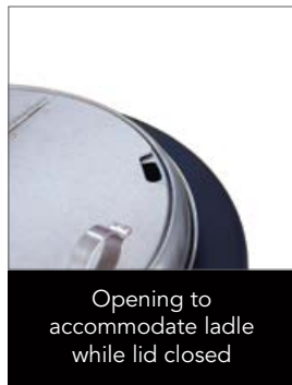
Opening to accommodate ladle while lid closed