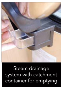
Steam drainage system with catchment container for emptying