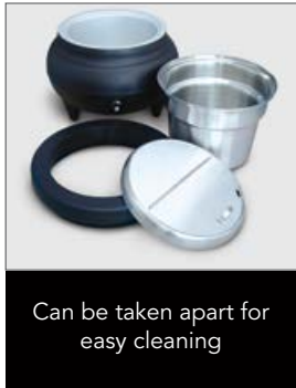
Can be taken apart for easy cleaning