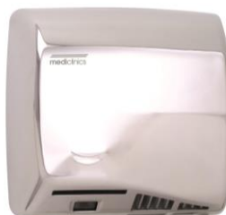
M17AC/M17AC-I Bright finish