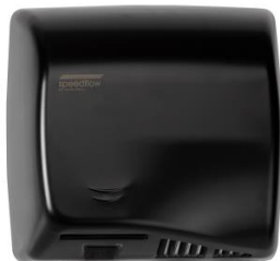
M17AB/M17AB-I Black finish