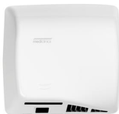
M17A/M17A-I White finish