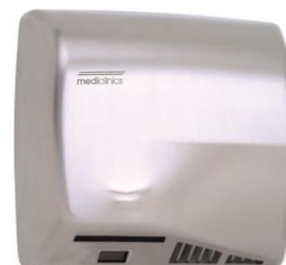
M17ACS/M17ACS-I Satin finish