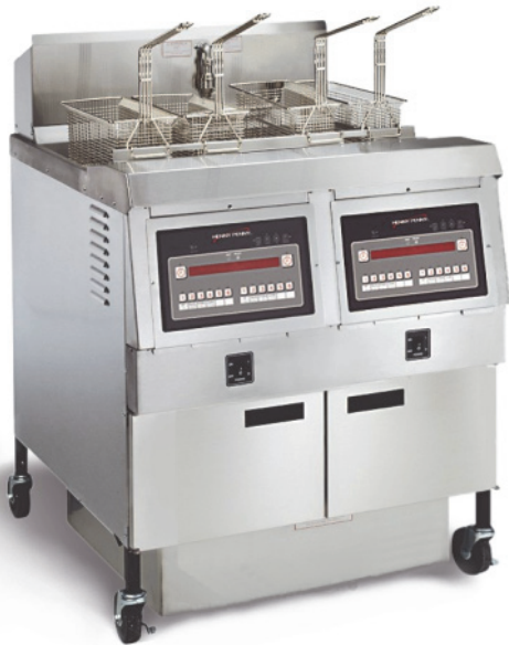
OFG 322 2-well gas open fryer with Computron™ 8000 control

Henny Penny open fryers offer high-volume, integral multi-well frying with programmable operation, oil management functions and fast, easy filtration.