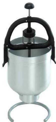
Table Stand NEE-40003

3 Litre capacity. Dismountable for easy cleaning. Comes with stand $780