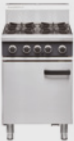
CR6D Four Burner Gas Range Static Oven

W 600mm D 800mm H 915mm INCL. SPLASHBACK 1085mm