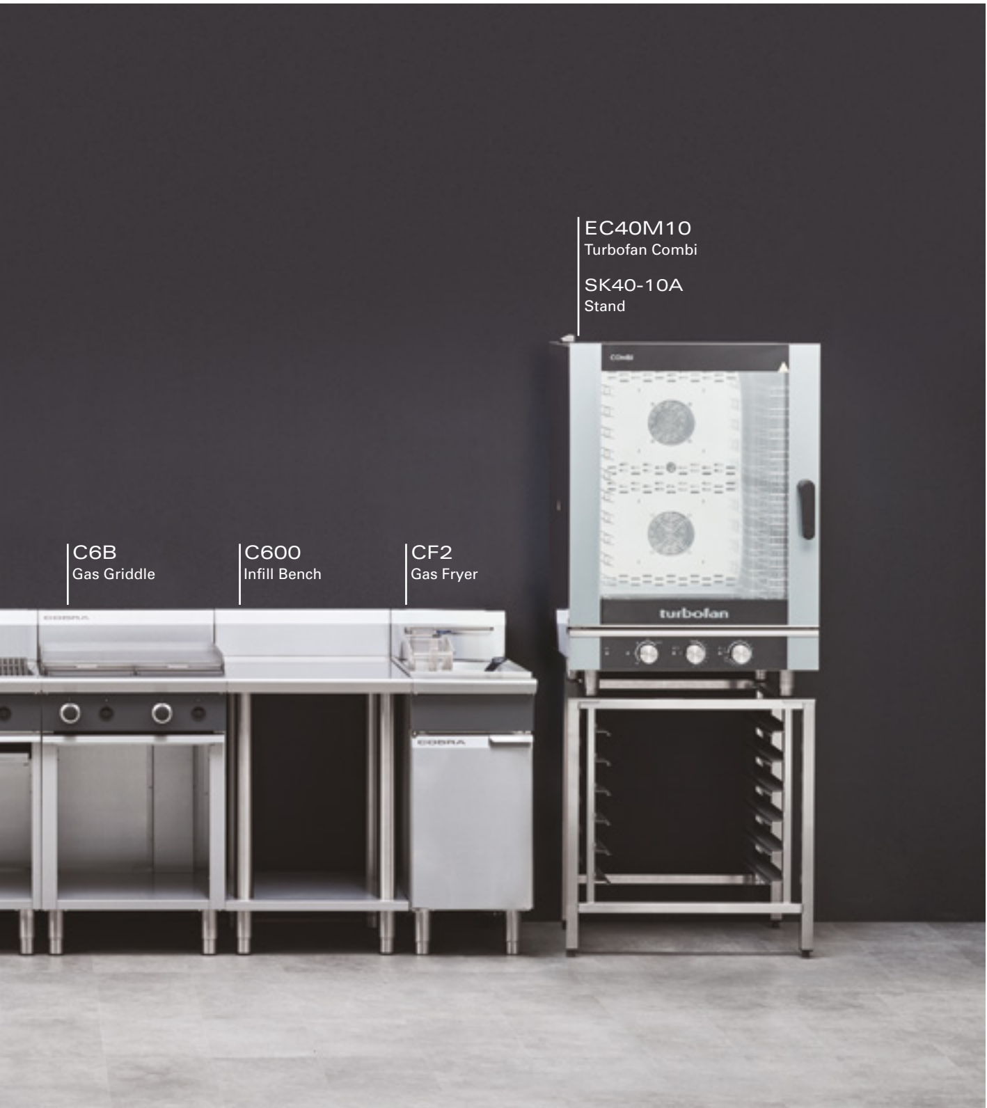
C6B Gas Griddle