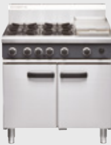
CR9C Four Burner/Griddle Gas Range Static Oven

W 900mm D 800mm H 915mm INCL. SPLASHBACK 1085mm