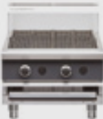
CB6-B Gas Barbecue Bench Model

W 900mm D 800mm H 915mm INCL. SPLASHBACK 1085mm