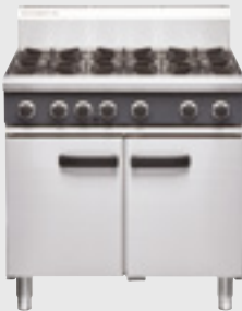
CR9D Six Burner Gas Range Static Oven

W 900mm D 800mm H 915mm INCL. SPLASHBACK 1085mm