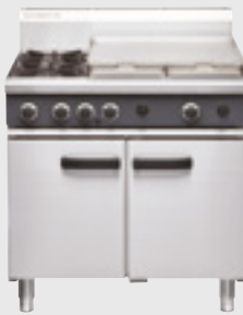
CR9B Two Burner/Griddle Gas Range Static Oven

W 900mm D 800mm H 915mm INCL. SPLASHBACK 1085mm