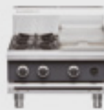
C6C-B Two Burner/Griddle Gas Cooktop Bench Model

W 600mm D 800mm H 315mm INCL. SPLASHBACK 485mm