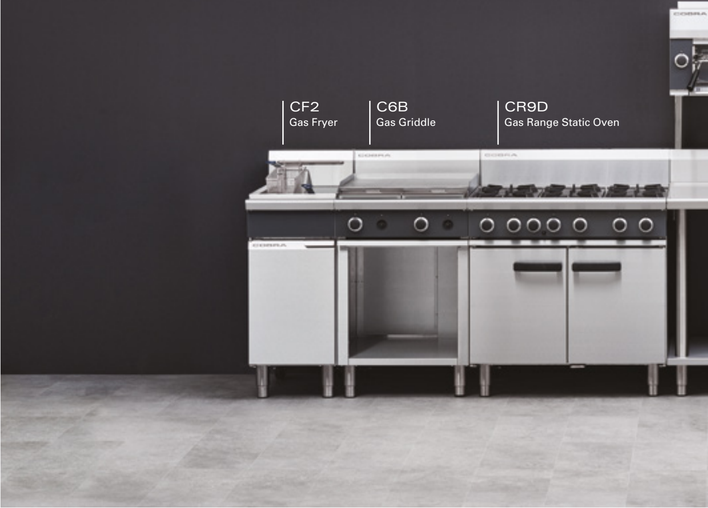
A SUGGESTED CAFÉ LINEUP