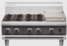
C9C-B Four Burner/Griddle Gas Cooktop Bench Model