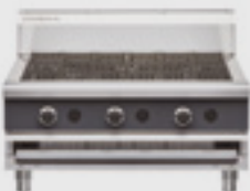
CB9-B Gas Barbecue Bench Model

W 600mm D 800mm H 415mm INCL. SPLASHBACK 585mm