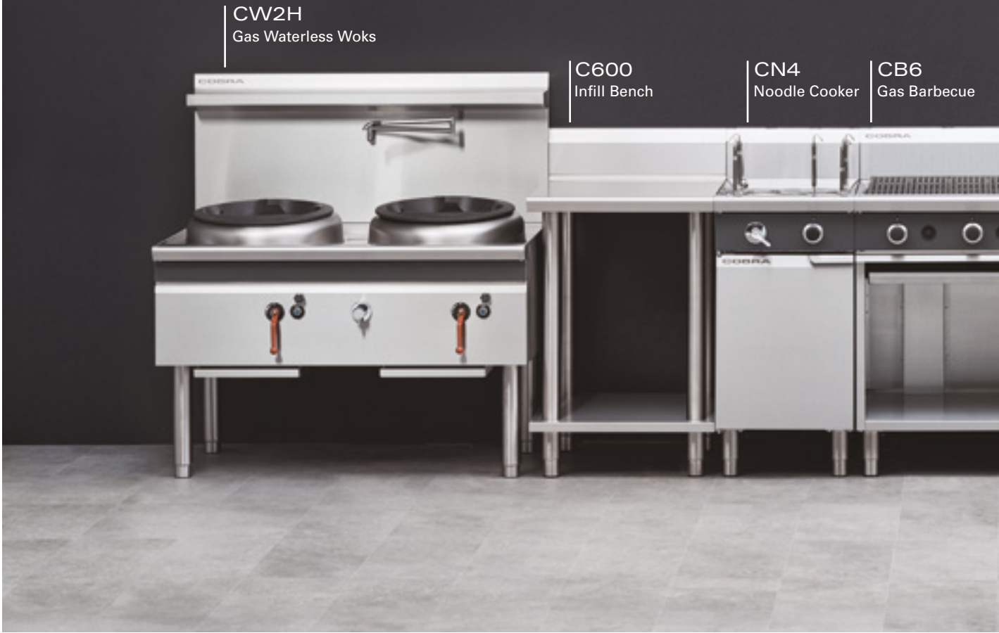
A SUGGESTED FUSION RESTAURANT LINEUP