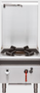
CSP6 600mm Gas Waterless Stockpot