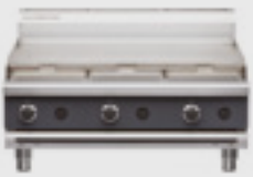
C9A-B Griddle Gas Cooktop Bench Model

W 900mm D 800mm H 915mm INCL. SPLASHBACK 1085mm