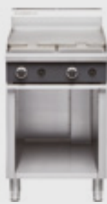
C6B Griddle Gas Cooktop