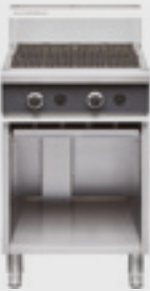
CB6 Gas Barbecue