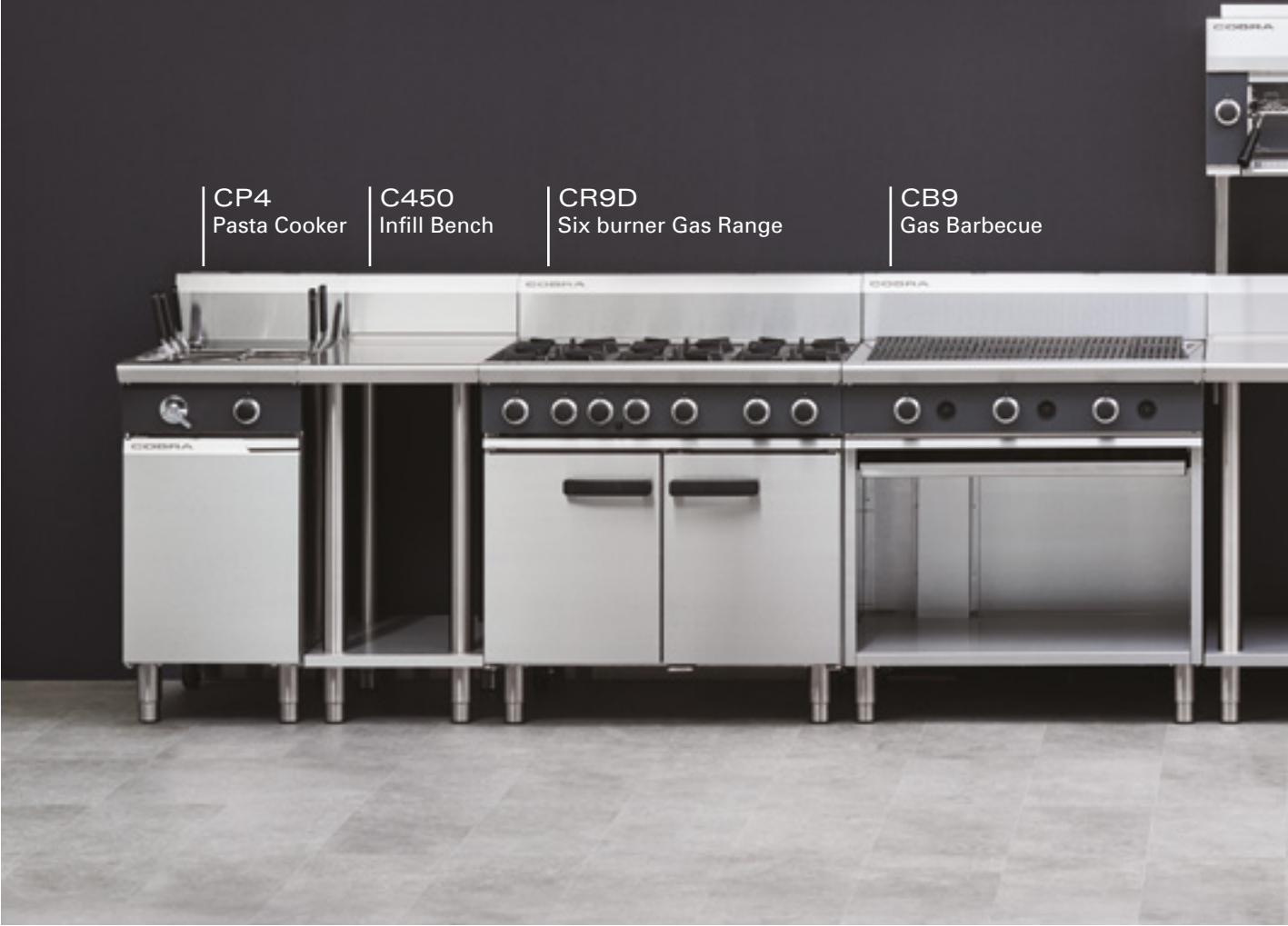
A SUGGESTED À LA CARTE RESTAURANT LINEUP