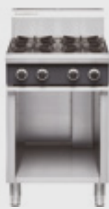
C6D Four Burner Gas Cooktop

W 600mm D 800mm H 915mm INCL. SPLASHBACK 1085mm