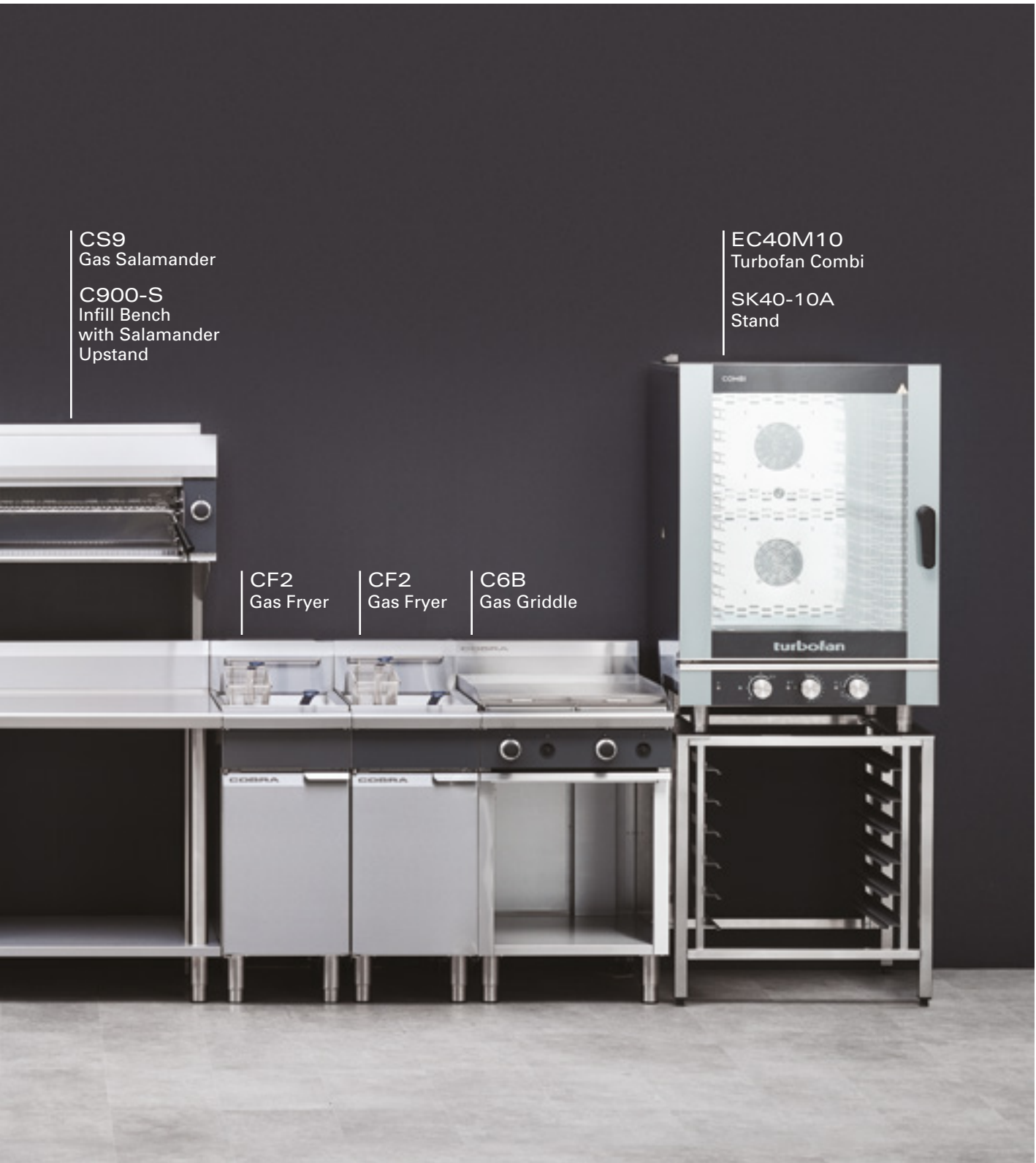
CS9 Gas Salamander