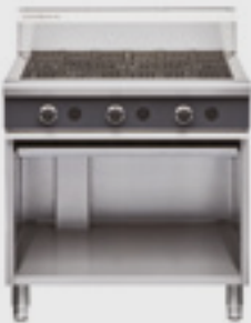
CB9 Gas Barbecue

W 600mm D 800mm H 915mm INCL. SPLASHBACK 1085mm