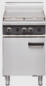
CR6B Griddle Gas Range Static Oven