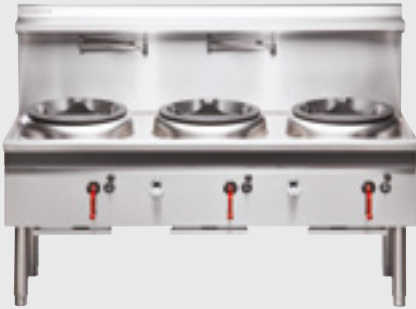
CW3H 1800mm Three Hole Gas Waterless Woks

W 1200mm D 800mm H 771mm INCL. SPLASHBACK 1280mm