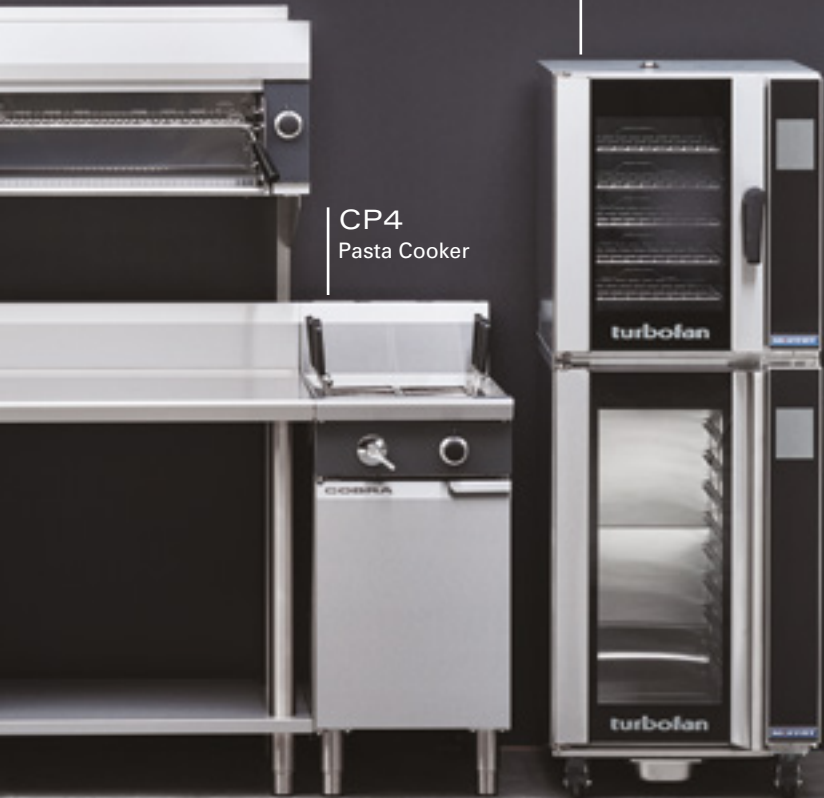
H10T Turbofan Holding Cabinet