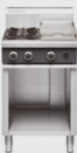
C6C Two Burner/Griddle Gas Cooktop

W 600mm D 800mm H 915mm INCL. SPLASHBACK 1085mm