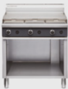
C9A Griddle Gas Cooktop