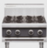
C6D-B Four Burner Gas Cooktop Bench Model

W 600mm D 800mm H 315mm INCL. SPLASHBACK 485mm