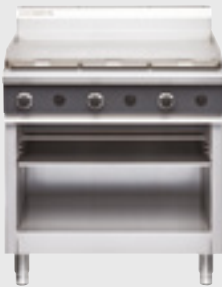
CT9 900mm Gas Griddle Toaster

W 600mm D 800mm H 915mm INCL. SPLASHBACK 1085mm