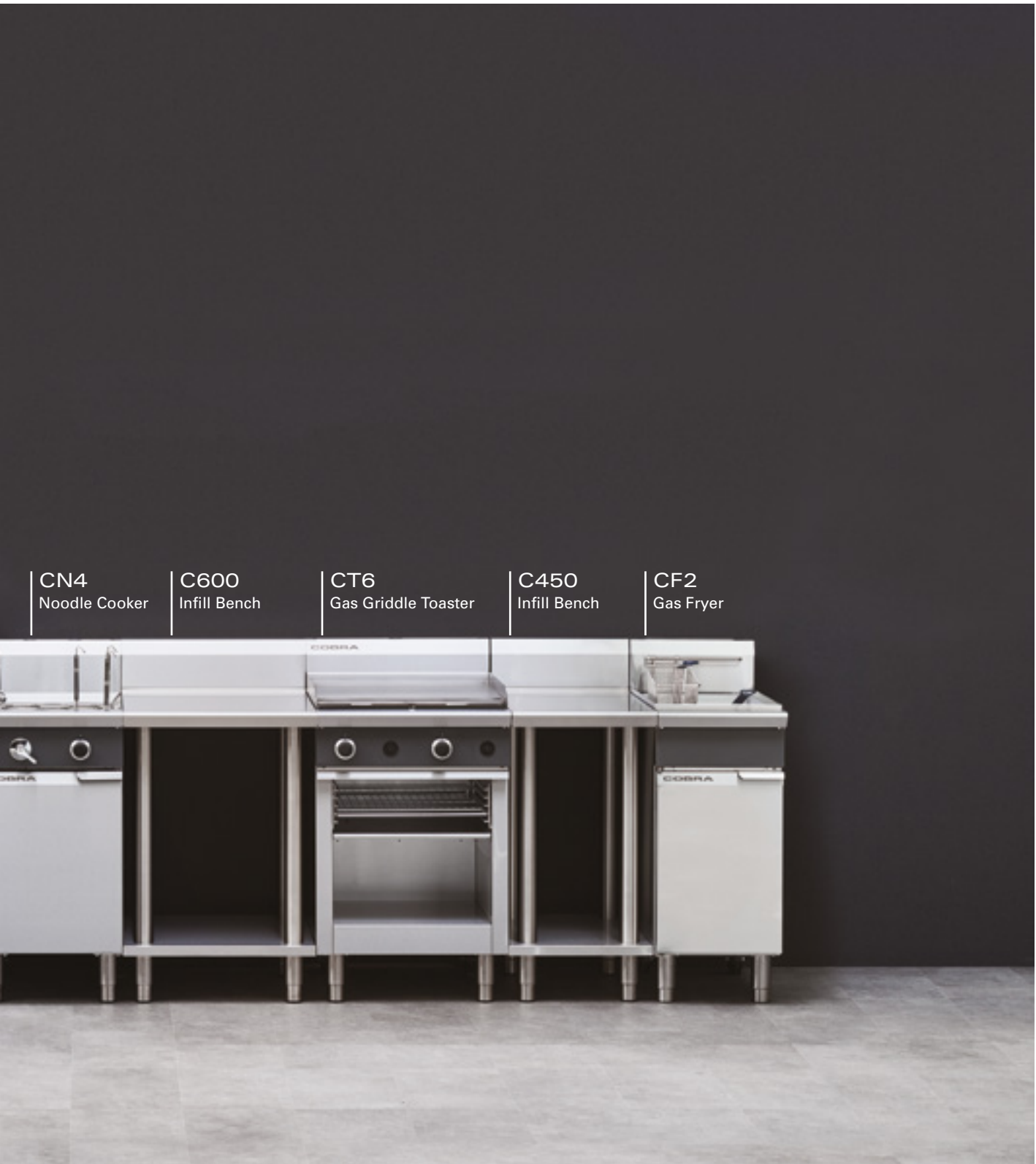
CN4 Noodle Cooker