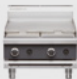
C6B-B Griddle Gas Cooktop Bench Model

W 600mm D 800mm H 915m INCL. SPLASHBACK 1085mm