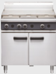
CR9A Gristle Gas Range Static Oven