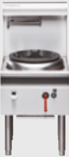
CW1H 600mm One Hole Gas Waterless Wok

CW1H-C 1 Hole, 1 Chimney Burner CW1H-D 1 Hole, 1 Duckbill Burner