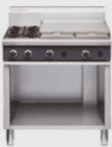
C9B Two Burner/Griddle Gas Cooktop

W 900mm D 800mm H 915mm INCL. SPLASHBACK 1085mm