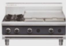
C9B-B Two Burner/Griddle Gas Cooktop Bench Model

W 900mm D 800mm H 315mm INCL. SPLASHBACK 485mm