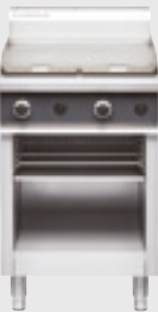
CT6 600mm Gas Griddle Toaster