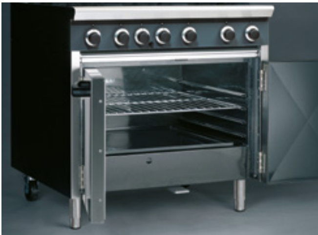
THE 900MM WIDE COBRA OVEN RANGE FEATURES A FULL WIDTH OVEN WITH GENEROUS CROWN HEIGHT AND SPACE SAVING FRENCH DOORS.