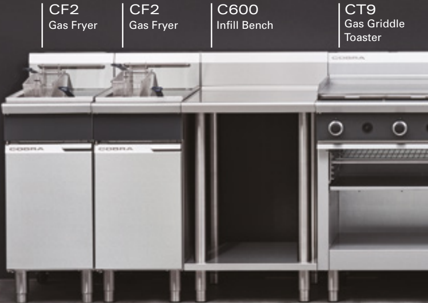
A SUGGESTED EVENT CENTRE LINEUP