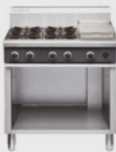
C9C Four Burner/Griddle Gas Cooktop

W 900mm D 800mm H 915mm INCL. SPLASHBACK 1085mm