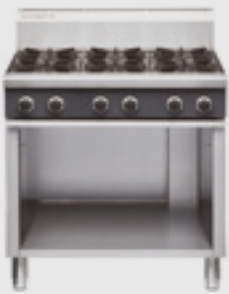
C9D Six Burner Gas Cooktop

W 900mm D 800mm H 915mm INCL. SPLASHBACK 1085mm