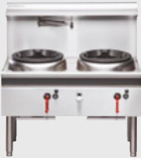
CW2H 1200mm Two Hole Gas Waterless Wok

W 600mm D 800mm H 771mm INCL. SPLASHBACK 1280mm