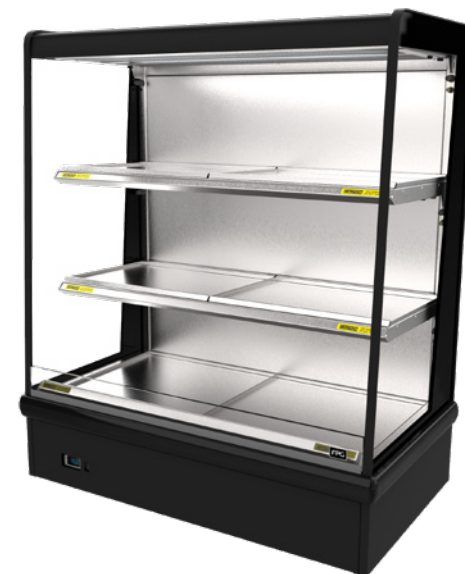
Standard height with 2 shelf levels + base