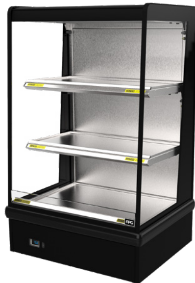
Standard height with 2 shelf levels + base