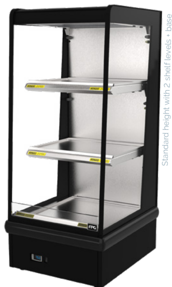
Standard height with 2 shelf levels + base