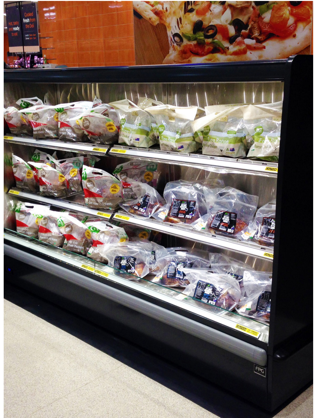
Woolworths Supermarket, Greystanes, Sydney, Australia

In the Visair heated cabinets, pluggable LED lighting is located at the top of the cabinet and at each shelf level. The plug-in feature enables the LED lighting to be replaced without the need for an electrician. With a lifetime of 25,000 hours, they will not need to be replaced very often!