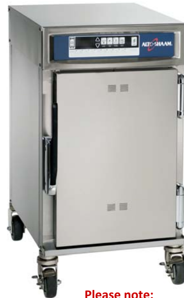
Please note: Supplied with glass door

Oven is equipped with side racks with pan positions spaced on 35mm centers, 2 x stainless steel wire shelves, stainless steel drip pan with drain and external drip tray and casters.