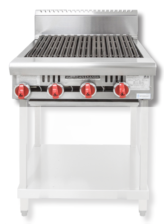
Model shown with optional equipment stand