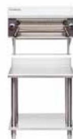
CS9 / C900-S