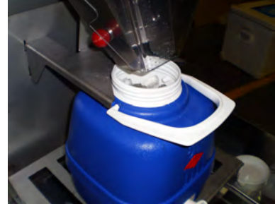
Jug Filler Dispenser Attachment

The perfect solution for employees working in mines, on construction sites, LNG industries or tough working conditions that require ice for hydration.