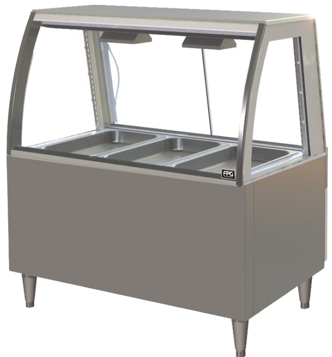
Showing : Inline 3000 Series Bain Marie heated 1200mm curved freestanding fixed front