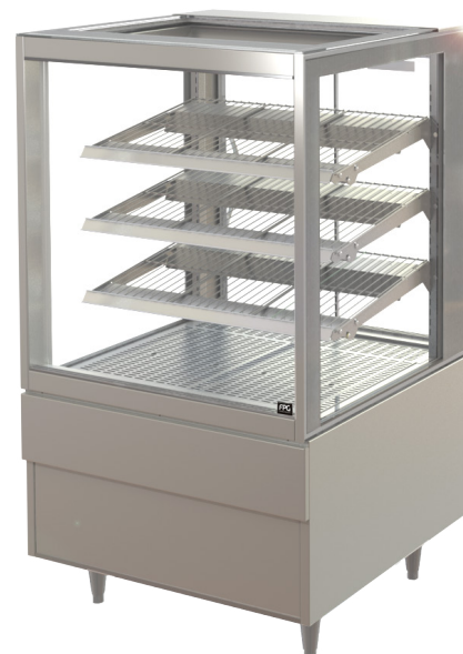
Showing : Inline 4000 Series heated 800mm square freestanding with fixed front