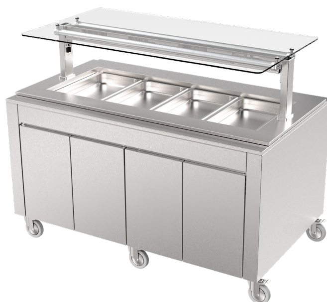
Showing : Inline GN Series Mobile heated 4x 1/1 pans, fitted with flat self-serve gantry (option) and GN pans (accessories)