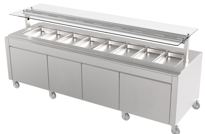
Showing : Inline GN Series Mobile heated 8x 1/1 pans, fitted with flat self-serve gantry (option) and GN pans (accessories)