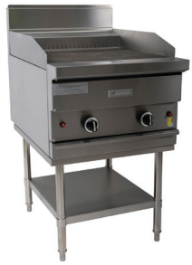
GF24-BRL pictured with optional stand

Cast-iron burners for every 152mm section and heavy duty ceramic briquettes sitting on horizontal bars distribute heat evenly. Protected individual pilot lights, piezo spark ignition and flame failure as standard. Exclusive lift-off hopper. Hi-Lo Valves. Large easy-to-use control knobs sit flush to the 'plate rail' and the unit can sit on top of the optional stainless steel stand with storage shelf.