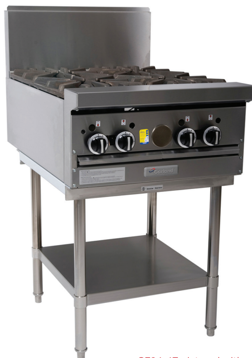
GF24-4T pictured with optional stand