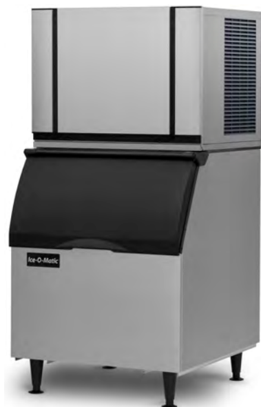
CIMO435 ON B40