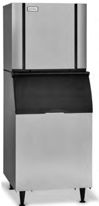
CIM1135 ON ICB230SC