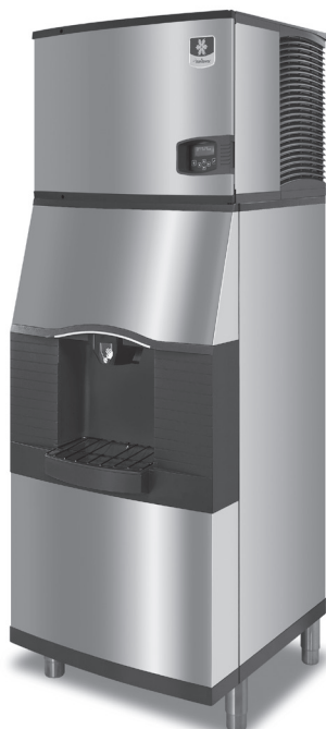
Indigo Series 450 Ice Machine SPA-310 Ice Dispenser

Ice only dispense, with coin-op and room card dispensing control options