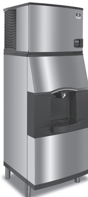
Indigo Series 450 Ice Machine SFA-291 Ice & Water Dispenser