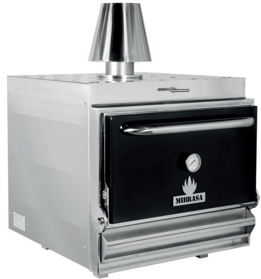
Shown with optional Firebreak