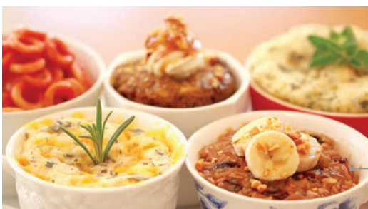
Even cooking and heating results