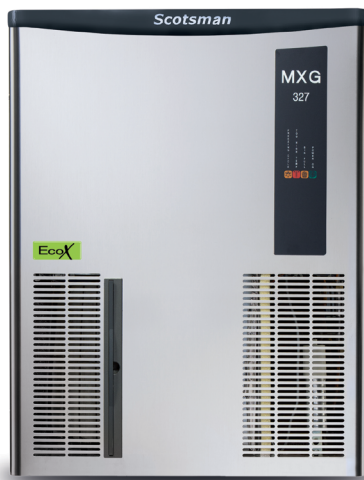
Medium gourmet cube 20g, 30mm dia x H 34mm