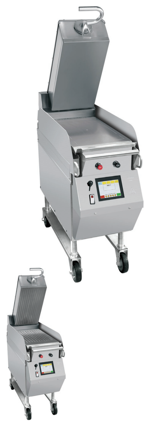
Model G828 Includes grooved upper platen and lower cooking surface.