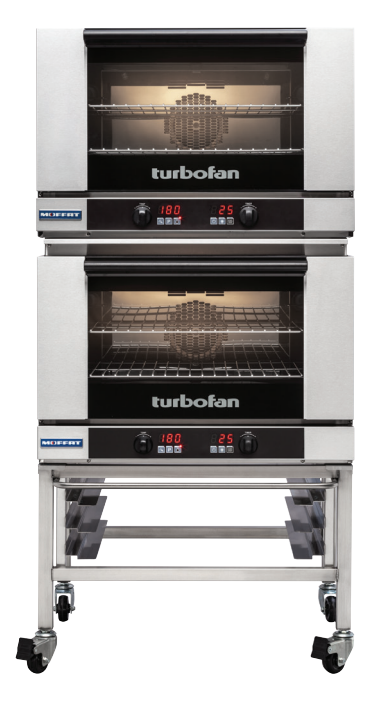
Model E27D2/2C shown

Full Size Digital / Electric Convection Ovens Double Stacked on a Stainless Steel Base Stand