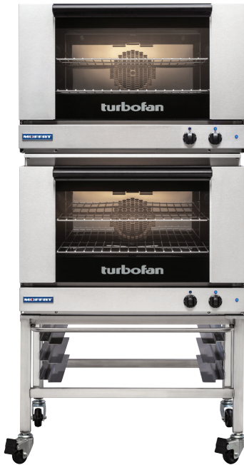
Model E27M2/2C shown

Double Stacked on a Stainless Steel Base Stand