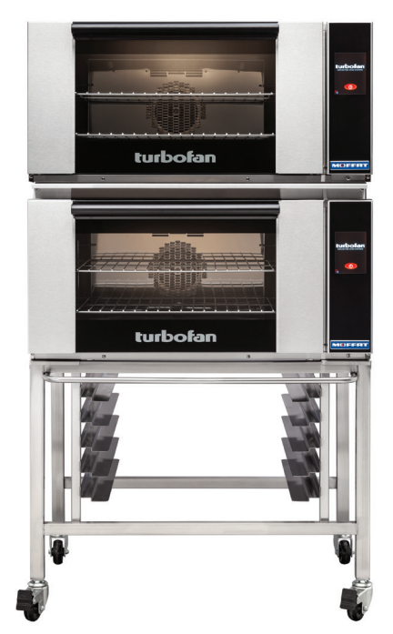
Model E27T2/2C shown

Full Size Electric Convection Ovens TOUCH SCREEN CONTROL Double Stacked on a Stainless Steel Base Stand