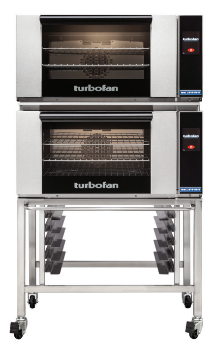
Model E27T3/2C shown

Full Size Electric Convection Ovens TOUCH SCREEN CONTROL Double Stacked on a Stainless Steel Base Stand