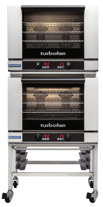
Model E28D4/2C shown

Full Size Digital / Electric Convection Ovens Double Stacked on a Stainless Steel Base Stand