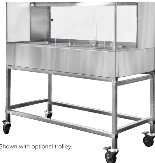
Shown with optional trolley.