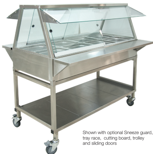
Shown with optional Sneeze guard, tray race, cutting board, trolley and sliding doors