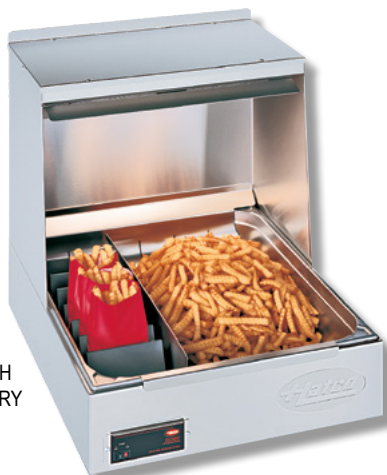
SHOWN WITH OPTIONAL FRY RIBBON

The slotted holding bin permits rising heat to envelop the food, preventing soggy product and various optional hardcoated fry ribbons are offered to stage boxed and/or bagged products for quick-serve areas.