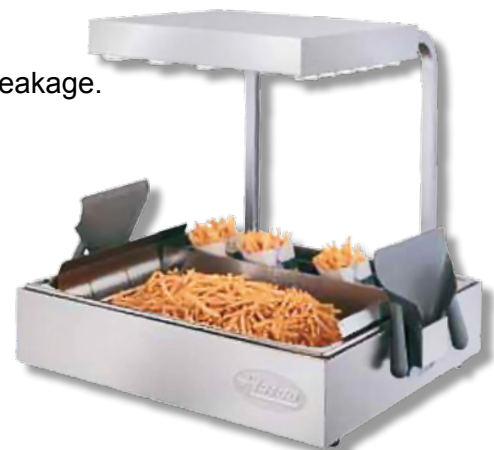
SHOWN WITH OPTIONAL FRY RIBBON