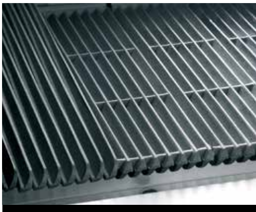
Heavy-duty reversible grates for level or inclined use.

Ask for a detailed specification sheet on any of the Waldorf Bold Chargrills outlining construction, features, options and installation information.