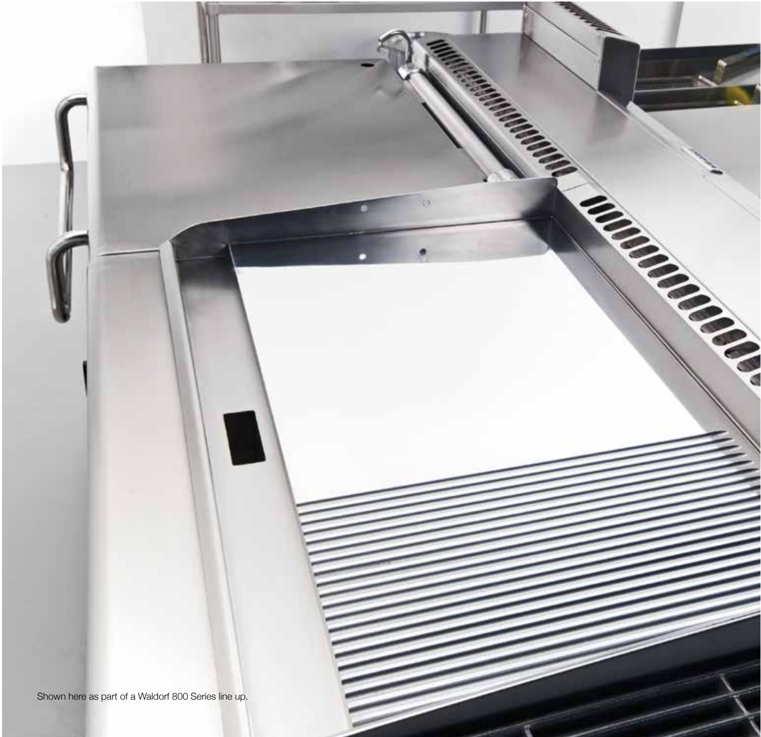
Shown here as part of a Waldorf 800 Series line up.

Griddle Oven Range includes - Drop down door with welded frame Fully welded and vitreous enamelled oven liner Cool touch stainless steel door handle Easy clean, installation and service