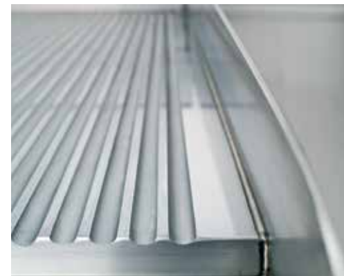
The 3mm splashguard is a fully welded hob surround providing extra durability.