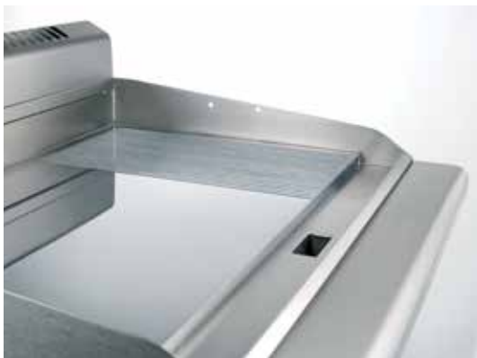
Mirror chromed griddle plate with a combined smooth and ribbed surface.